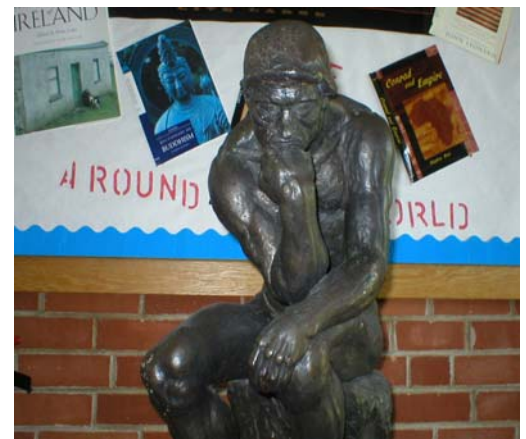
A sculpture "thinking"... Where am I?