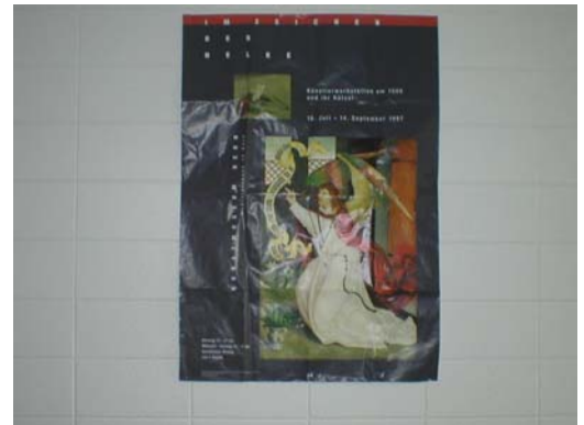
A nice poster that has an angel with artistic skills. Where is this located?