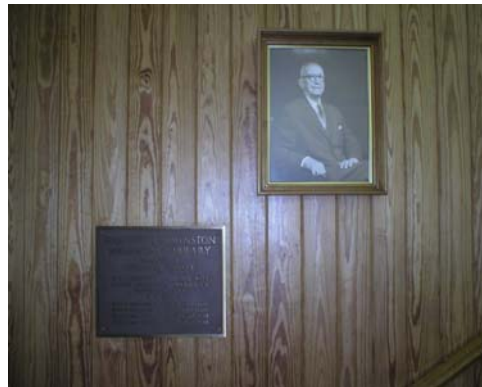
A man and a plate explaining his goals. Where is this picture taken?