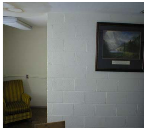
Feeling tired? A sofa and a picture on the wall. Where am I?