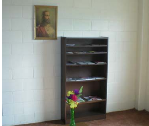
This picture has God and a bookshelf. Where is this picture taken?

The play is about a particular hotel room in which interesting events occur. Couples with affairs, failed marriages, and a very odd bellhop all play a crucial role in the play. The performance will be on April 21 and 22. Times are to be determined. Look around campus for info. This play is sure to have you laughing so come out and enjoy the show!