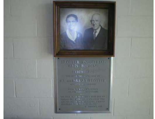
The people for whom the building is named. Where is this picture taken?